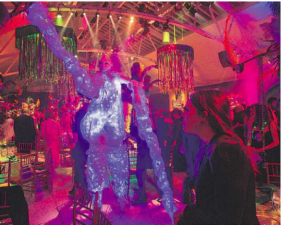
Living art wows: The LED-lit Light Beings perform for the first time in Quebec to rave reviews at the Mardi Gras-themed Daffodil Ball. VINCENZO D'ALTO