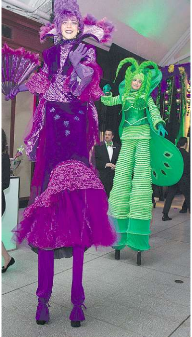
Insanely fabulous: Over-the-top strolling performers animate cocktails and the Mardi Gras parade. VINCENZO D'ALTO