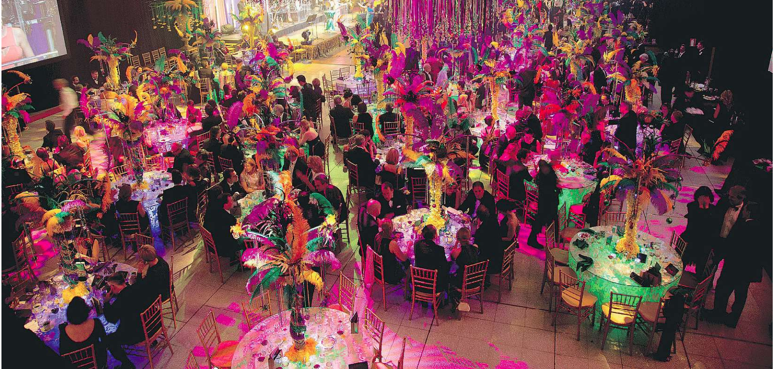
Daffodil goes Mardi Gras: Decortainment was at its best at the 2016 Daffodil Ball.